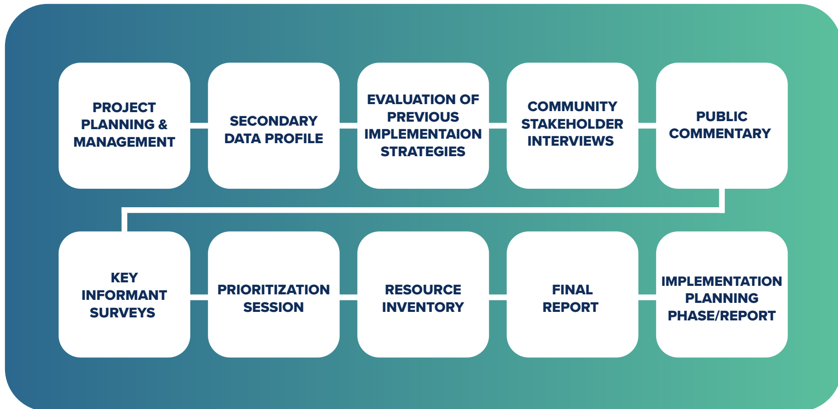
Figure 1: Process Chart

With the Patient Protection and Affordable Care Act (PPACA) enactment on March 23, 2010, tax-exempt hospitals require community health needs assessments (CHNA) and implementation strategies, which are approaches and plans to improve the health of communities served by health systems actively. Through coordination and community development, initiatives based on the outcomes of the community health needs assessment, Terrebonne General Health System (Terrebonne General) is implementing strategies to address identified health needs and impact the health of their community. These strategies provide hospitals and health systems with the information they need to deliver community benefits that can be targeted to address the specific needs of their communities.